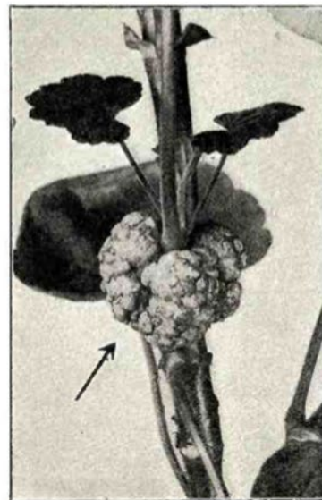
A plant inoculated with cancer before treatment. The arrow points to the tumor growing on the limb.

The remedy in my opinion, is not to kill the microbes in contact with the healthy cells, but to reinforce the oscillations of the cell either directly by reinforcing the radio activity of the blood or in producing on the cells a direct action by means of the proper rays. During January, 1924, I began to build, according to this theory, and with